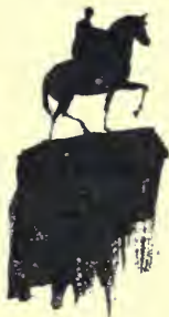
The Copper Horse